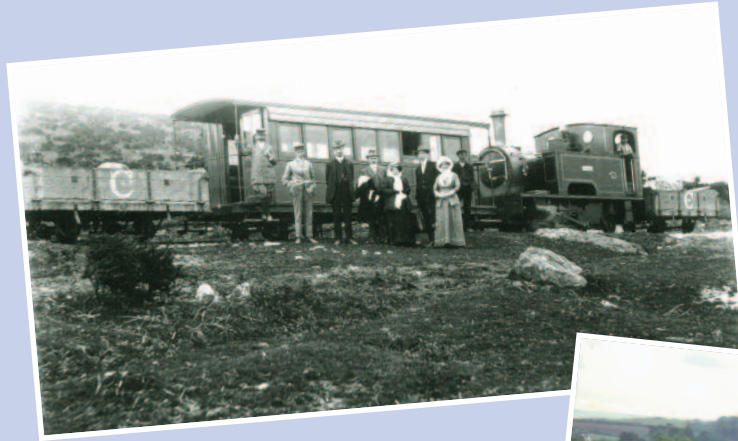
Dignitaries attending the opening of the Redlake Tramway 11 September 1911.