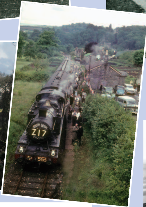
Left: A busy scene at Lustleigh, 1962.