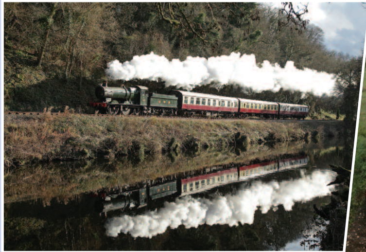
A mirror image reflection of Collett 0-6-0 3205 passing with the 1500 Totnes- Buckfastleigh.