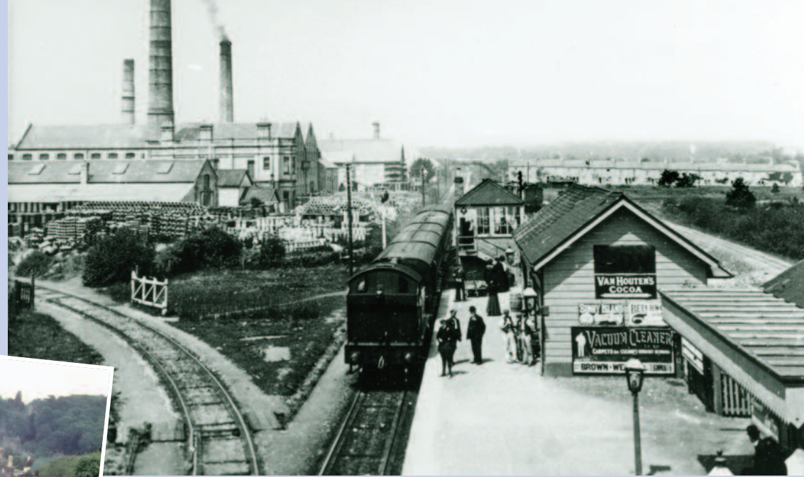
Above: Heathfield Station and the Candy tile works c.1920.