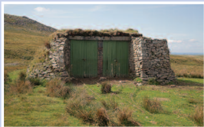
Sturdily built of local materials the double track locomotive shed of the Rowtor Target Railway.