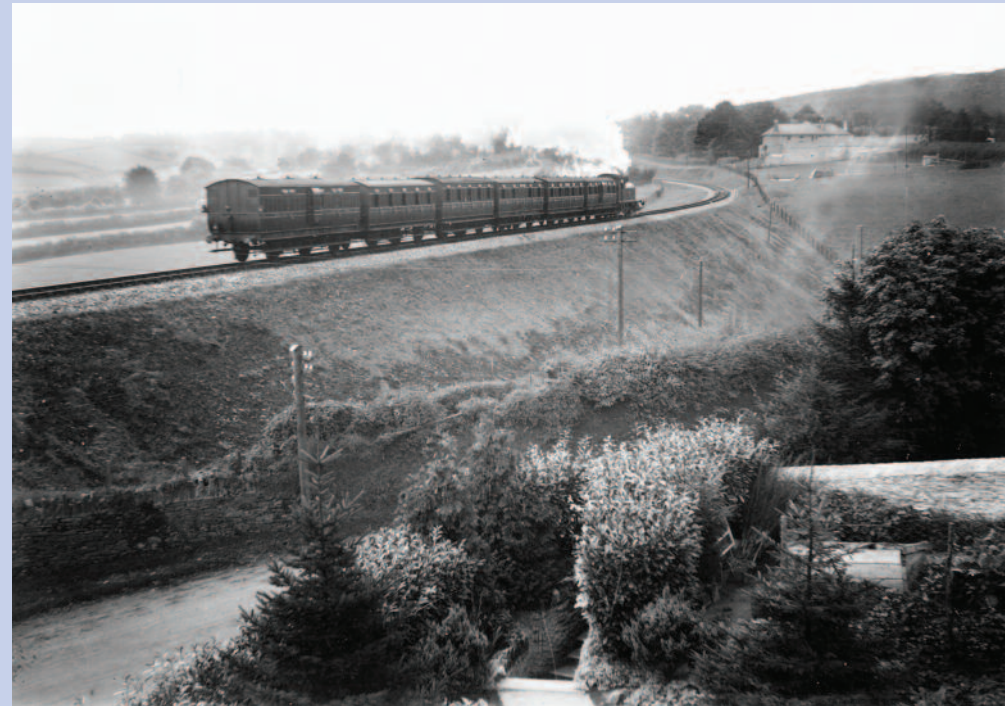
Below: A Plymouth-bound train pulling away from Horrabridge up the 1 in 60 grade towards Yelverton.